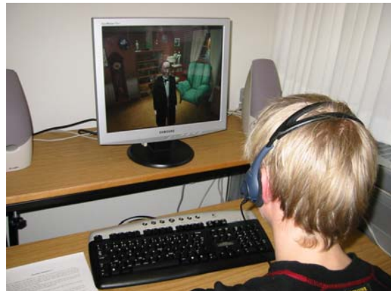
Figure 2. A user in action.

Users often arrived two at a time so two test rooms were prepared with the following setup: a touch screen, a keyboard (for changing virtual camera angle), a headset, and two cameras for recording the user-system interaction. The HCA software was running on two computers for practical reasons. The animation part was running on the computer connected to the touch screen and the rest of the system was on the second machine which was being monitored by a developer behind the user's back. In case of problems, the developer would take immediate action by, e.g., restarting a module causing the problem. Only rendering engine problems would require operations via the screen in front of the user. User input, system output, and interaction between modules was logged.