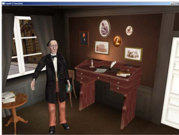
Figure 1. HCA gesturing in his study.

ments on what HCA is saying, or point to objects in HCA's study at any time, and receive his response when appropriate. 3D animated HCA communicates through audiovisual speech, gesture, facial expression, body movement and action. The high-level theory of conversation underlying HCA's conversational behaviour is derived from analyses of social conversations aimed at making new friends, emphasising common ground, expressive story-telling, rhapsodic topic shifts, balance of "expertise", etc. [2]. When HCA is alone in his study, he goes about his work, thinking, meandering in locomotion, looking out at the streets of Copenhagen, etc. When the user points at an object in his study, he looks at the object and then looks back at the user before telling a story about the object.