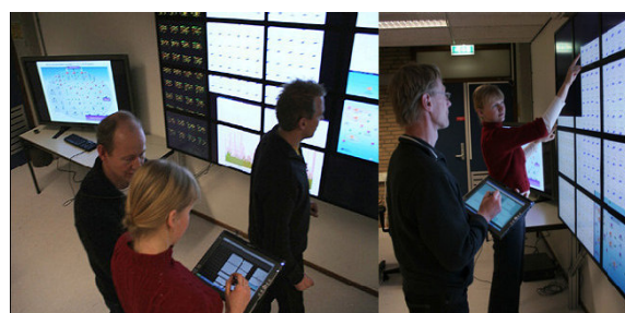
Figure 2. Collaborative work in the laboratory.

Collaboration is an essential aspect of life scientists' work, ranging from working together in the same physical space to co-publishing and distantly sharing work. During our field study we observed that being aware of each others' activities was an important aspect of scientists' work in the laboratory (Kulyk et al. 2007). Bioinformatics laboratories are full of displays (Figure